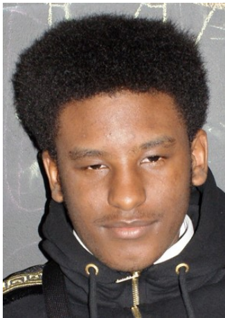
Deputy Head Boy